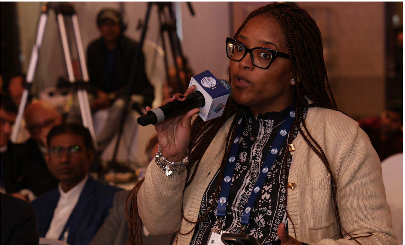
GS1 South Africa CEO Zinhle Tyikwe at the General Assembly 2025 CEO Workshop